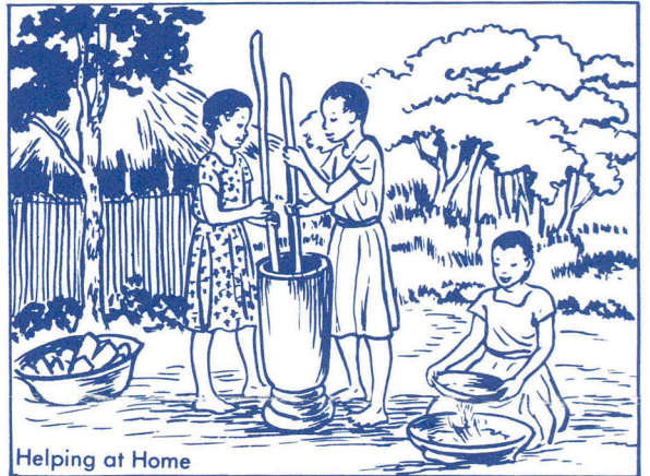
Helping at Home