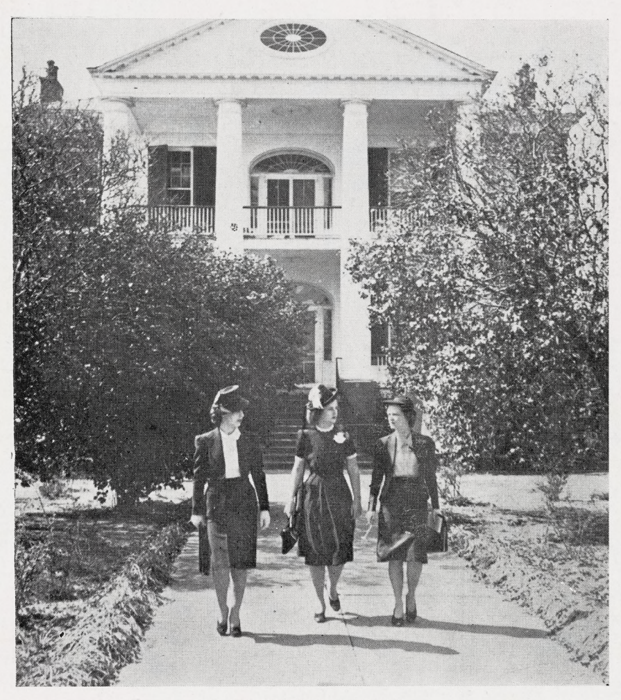
ALL SAINTS' COLLEGE Diocesan School of Mississippi