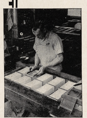
Laying sheets of 23-carat gold leaf on the edges of Harper Prayer Book pages.

The firm of Harper & Brothers is proud to be able to say that the bindings of the editions it offers are in the tradition such master bookmakers have maintained throughout the centuries.