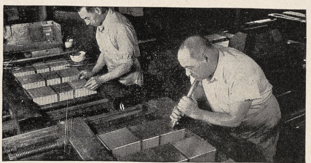
Burnishing the gold leaf onto the pages so that it becomes a permanent, never-tarnishing feature of beauty.

The firm of Harper & Brothers is proud to be able to say that the bindings of the editions it offers are in the tradition such master bookmakers have maintained throughout the centuries.