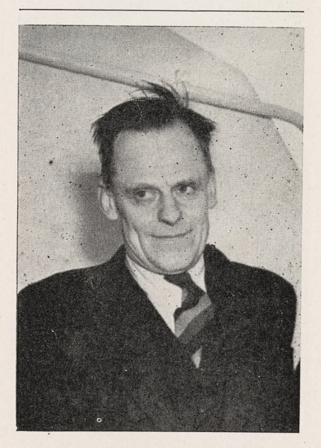
W. A. VISSER 't HOOFT, general secretary of World Council, speaks at mass meeting at Cleveland Convention

"C. Britain has in fact gained a great deal from recognition. We suffer only from the charge of hypocrisy because we still