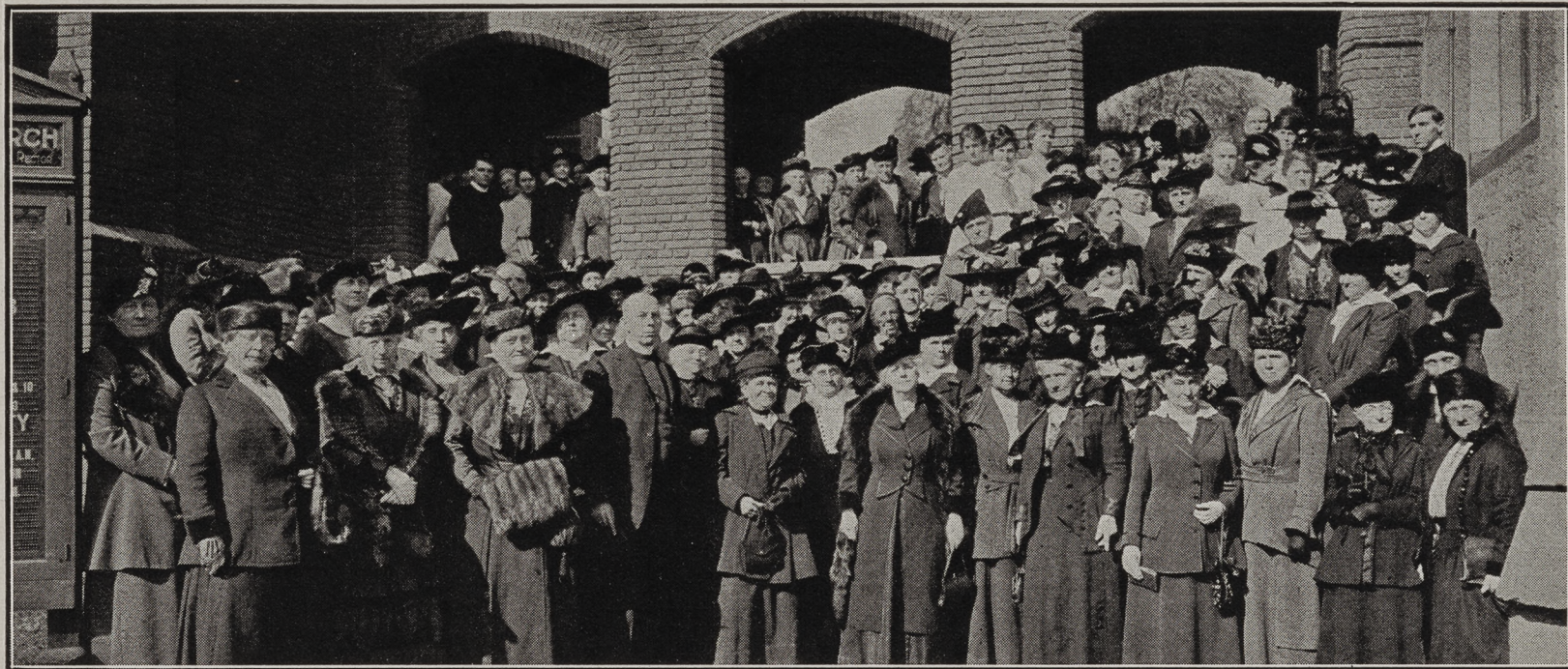
12 th Annual Convention St. John's Parish House Nor. 2-3, 1916 Lancaster, Pa.

Original document located in The Archives of the Episcopal Church.