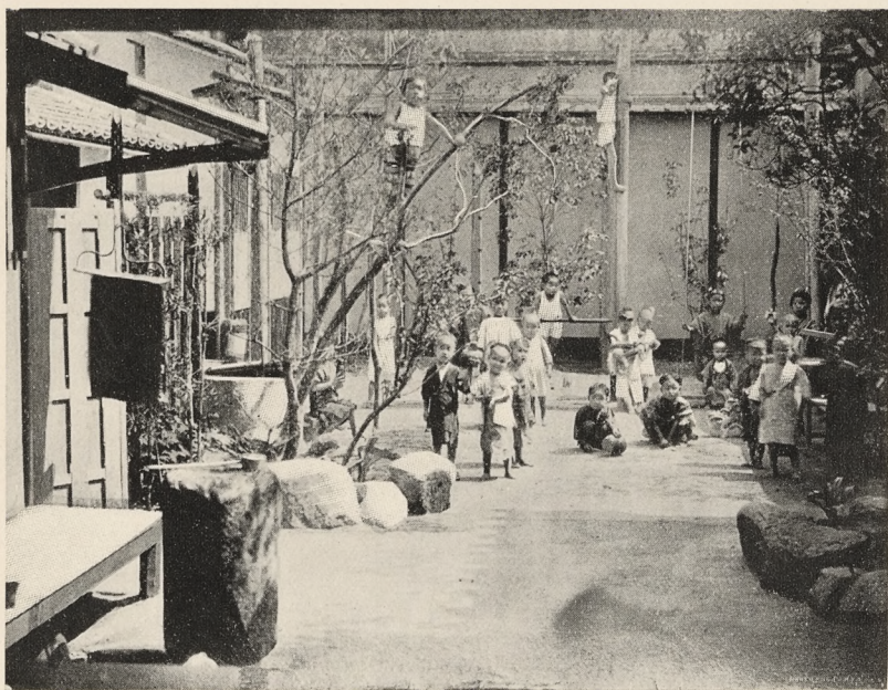
This picture, taken from one of the lantern slides, represents the play ground of St. John's Orphanage at Osaka, Japan. The Junior Auxiliary has largely contributed toward its support.