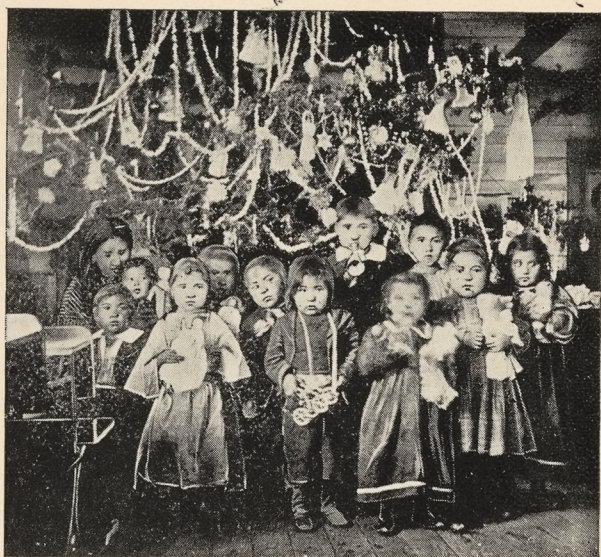
INDIAN CHRISTMAS TREE.