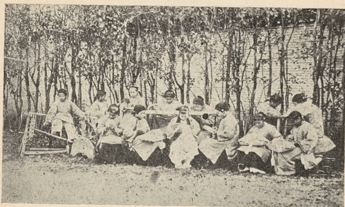
A JUNIOR MEETING IN CHINA.