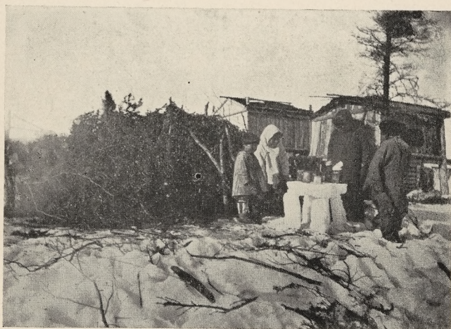
ALASKAN JUNIORS, PLAYING HOUSE.