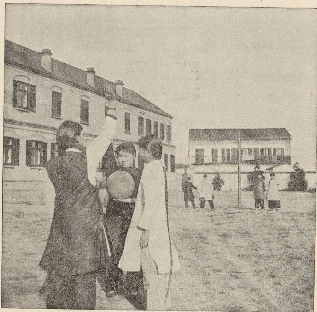
BASKET-BALL AT ST. MARY'S SCHOOL, SHANGHAI.