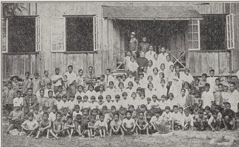
SCHOOL AT BONTOC, PHILIPPINE ISLANDS