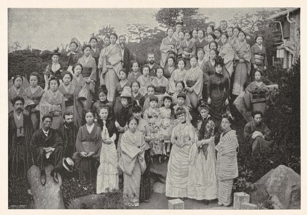
MISSIONARIES AND MEMBERS OF THE LADIES INSTITUTE, AT OSAKA, JAPAN.

Copyright 2022. Domestic and Foreign Missionary Society. Permission required for reuse and publication.