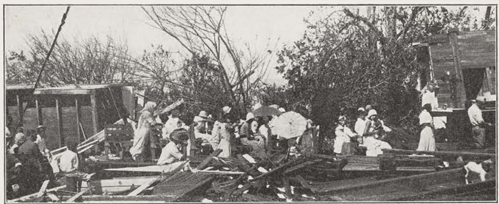
LA GLORIA CONGREGATION GATHERS FOR SERVICE AMID THE RUINS OF THEIR CHURCH