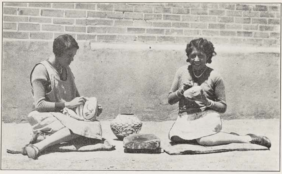
LEARNING THE ANCIENT INDUSTRIAL ARTS OF THEIR TRIBE These modern young Indian girls, students in a Government Indian school, take pride in mastering these arts. They represent the more mature Indian youth

theories of religious training, but how far short it came of providing a vital, transforming experience only an Indian knows.