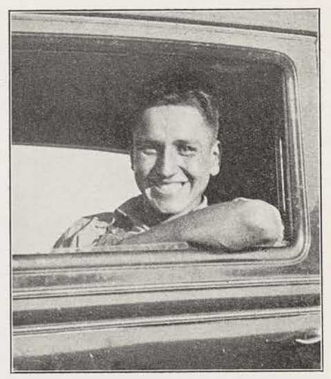
A PRESENT-DAY INDIAN AMERICAN This keen young Dakota Churchman, active in the Y.P.F., is a college junior

There is a section of the Indian student population which has long been opened directly to the ministries of the