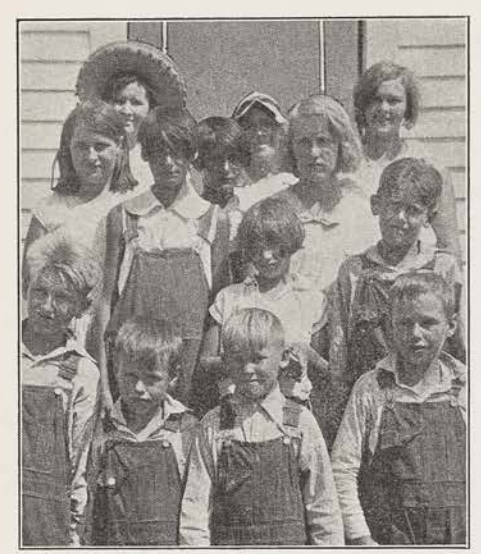
A DAKOTA INDIAN D.V.B.S. A C.A. worker gathered this group together near the Crow Creek Agency, South Dakota

The same idea is expressed by a Chipnewa official in the Indian Service: