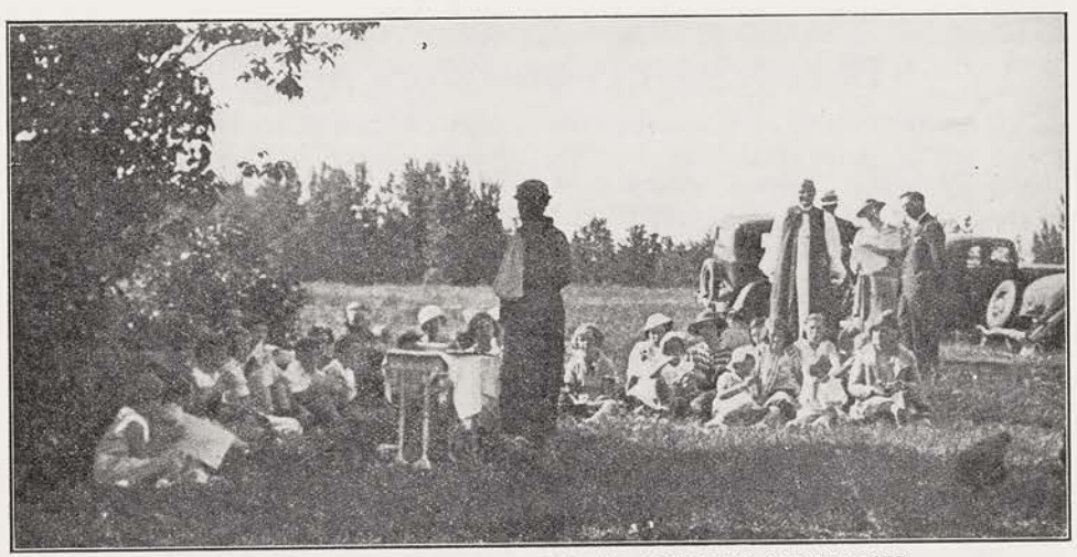
PROMOTION PARTY GROUP HEARS THE STORY OF ST. FRANCIS At the June, 1934, gathering fifty-one children were baptized. It is not unusual to have a glass dish placed on a painted table serve as a font on these occasions