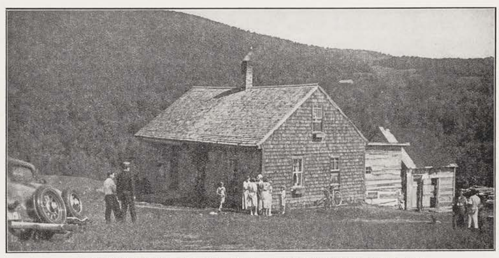
OVER THE HILLS AND FAR AWAY—A MOUNTAIN MISSION HOME The 1934 Promotion Party held at this home brought together a fine group of mothers and children whose first contact with the Church was through the M.M.M.

wall cards, a series of pictures, mostly sacred and fitted to the Church year, mounted calendar fashion above small pages of instruction and memory work.