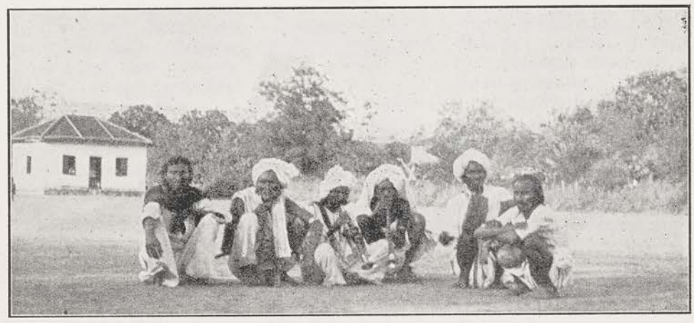
VILLAGE BAND PLAYS AT HARVEST FESTIVAL The building in the left background is the Reading Room. Mag contributed by Christians on the compound Magazines and papers are

They were baptized at the Harvest Festival, attended by all the people the Dornakal pastorate. There every one brings up at the time of the offering something to represent their thanks for the harvest just finished, We give money, but it came closer to reality to see these people giving their possessions. When an old woman gives an egg from one of her hens, when a shepherd gives one of his goats, when two sturdy farmers give a great sack of rice which they can hardly carry, when a carpenter gives a chair he has made, you feel that this giving is real. After the offering, the baptisms took place; the climax of a series of events which had been marked throughout by the mystic sense of unseen reality.