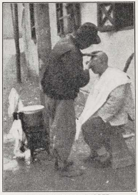
CHINESE STREET BARBER Equipped with the tools of his trade the barber is ready wherever he meets a customer. This picture was taken in Anking